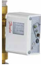
Pressure sensing switch